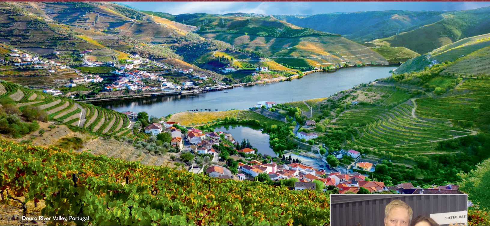
Douro River Valley, Portugal

UNCORK LOCAL TRADITIONS, SAVOR INTENSE FLAVORS AND ENJOY PALATE-PLEASING ADVENTURES DURING AN AMAWATERWAYS WINE CRUISE